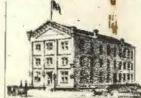
"SOUTH BACCHUS" OFFICE & PRINTING HOUSE