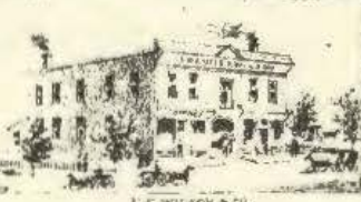
F. J. WILCOX & CO.