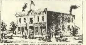
MANOLE'S SHEDS OF FINE CARRIAGES & HARNESS

ORBAILEY & CO. 1895. LITH. & PUB. BOSTON.