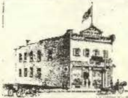
VAN VLIET BUILDING, JACOB VAN VLIET, PROP.